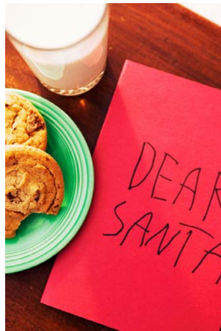
Lorraine's Custard Fruit Cake

Once you have sewn down both sides, flip the garment over, and with blunt tip scissors (or appliqué duck bill scissors) snip the fabric that lays beneath the lace. Turn the garment to the right side and you are done!